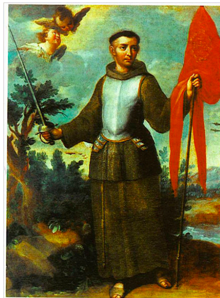
Saint John of Capistrano